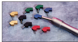
Figure 7: Colour-coded for easy recognition, six different diameters, in both 45 and 90 degrees, are available for the air abrasion handpiece

To begin the adhesion process, the tooth is etched and treated with a bonding agent. For the restorative, I prefer to use a flowable composite because it ensures that every irregularity from the preparation will be filled. As it flows, it restores. Some of these materials flow too much – moving all over the place before you can put your curing light to it. Based on my personal experience, I choose Den-Mat's Virtuoso Flowable. This material has enough flow to it while, at the same time, it stays in place without flowing