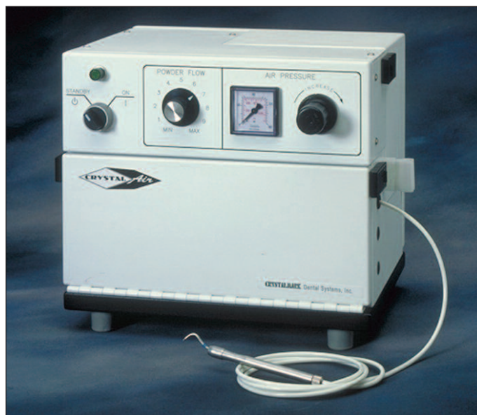
Figure 6: The Crystalmark air abrasion unit can use air or helium. The latter will prep twice as fast as air with no increase in patient sensitivity