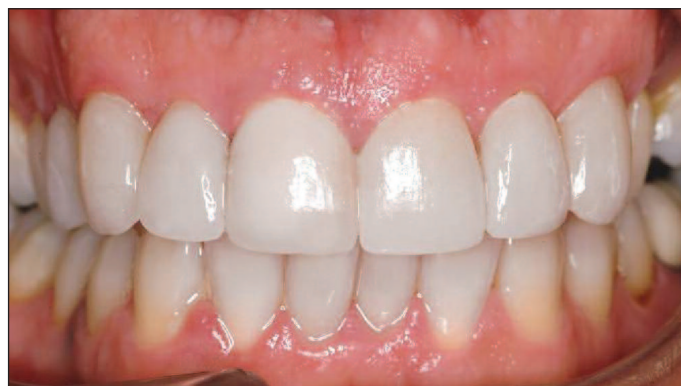
Figure 4: LUMINEERS by Cerinate porcelain veneers are placed over the existing PFM crown and natural dentition without the need for any anaesthesia