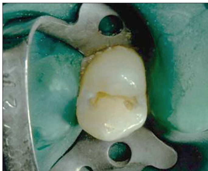
Figure 9: Air abrasion preparation removes only the decay