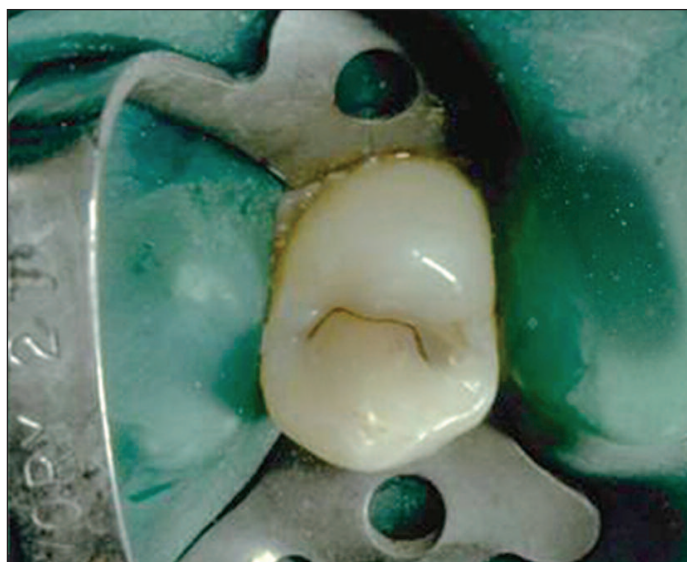
Figure 8: Pre-operative appearance of occlusal decay