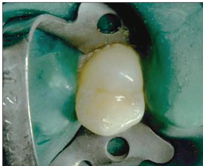
Figure 12: After air abrasion preparation, the tooth is restored with Virtuoso Flowable and polished for a beautiful finish.