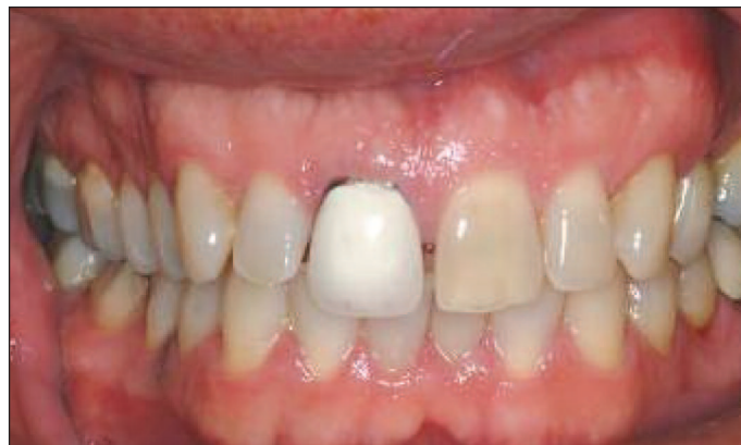
Figure 2: Although functional, the porcelain fused-to-metal (PFM) crown no longer matches the rest of the smile and displays metal at the gingival margin

Amalgam requires a minimum thickness for strength and undercuts for mechanical retention. This results in a large amount of preparation done at the expense of healthy enamel