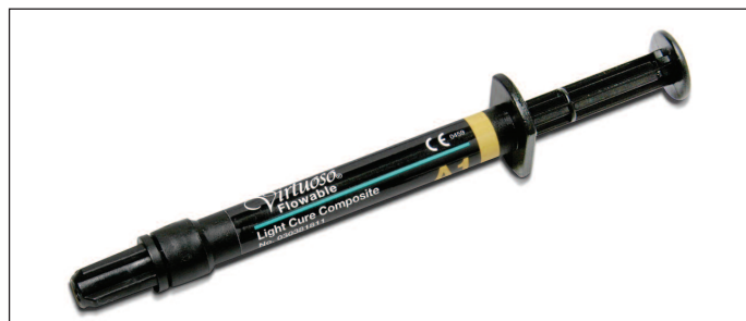
Figure 10: Virtuoso Flowable easily flows into small areas and has excellent handling