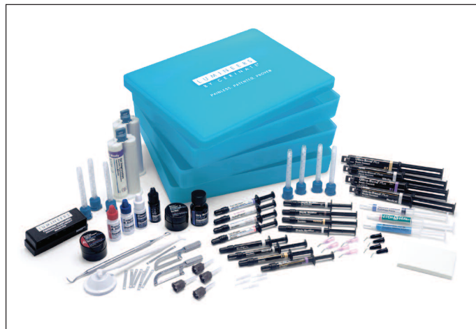
Figure 5: The LUMINEERS BY CERINATE system, including Ultra-Bond Plus resin bonding restorative and Tenure bonding system

Air abrasion combines an aluminium oxide powder with air. The manufacture of the powder may vary slightly, however it is generally available in two sizes. The diameter of the aluminium oxide particles may be either 27 micron or 50 micron. The 50 micron particle