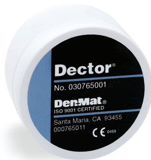
Figure 1: Den-Mat's Dector, my preferred caries detect stain, is an easy-to-spot green and is pre-loaded into miniature-sized unit dose dispensing sponges