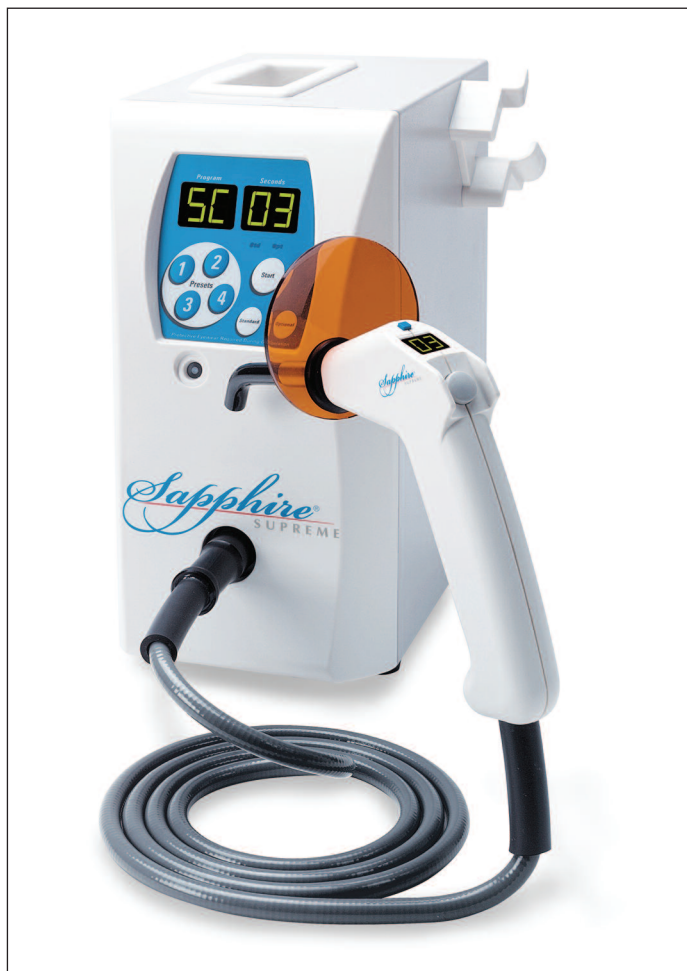
Figure 11: The Sapphire Supreme plasma arc light delivers the power to achieve maximum composite hardness in three seconds